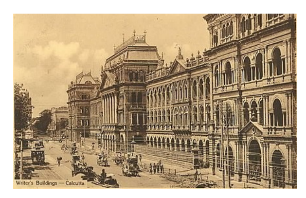
The writers building in Dalhousie Square, Calcutta. Once the most important financial hub of Asia

During and after the first world war, Indian industry began to boom. In the inter-war years, India saw the dramatic growth of an Indian proletariat. This growth took place at a time when the Russian revolution had shaken the capitalist world order to it's core and given hope to workers across the world, that they could overthrow a capitalist system in their countries. The communist movement emerged, together with a radicalized trade union movement, no longer satisfied by social democracy.