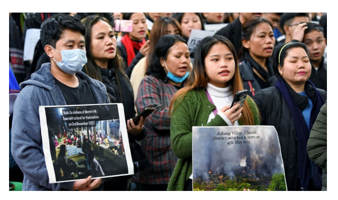
Kuki Zo groups boycotting elections

With the silence of almost every mainstream Indian news media channel, it is easy to forget