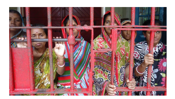
Inmates in Matia detention camp in Assam

The map of greater India is a visual realization of this macabre dream, and it has found a place in the new Indian parliament.