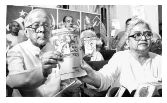
The former chief minister Jyoti Basu (L) the leader of the CPIM in West Bengal

It was only after independence, that the party grew in power and popularity. The party played a leading role in peasants struggles in Southern India, built a massive trade union network in present day Tamil Nadu and Bombay, and built a strong support base among Bengali Hindu namashudra refugees coming from the then East Pakistan.