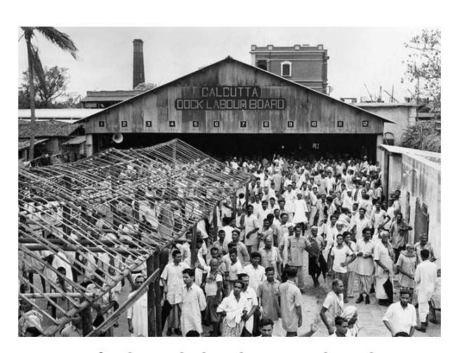
A scene of Calcutta dockworkers on strike in the 1960s

United Bengal was a political and economic powerhouse within India. The bourgeoisie based in Calcutta was influential, and assumed a leading role in the Indian independence movement. It was both a fountainhead of Indian capitalism, and a center of the communist movement. It was not surprising then, that the British would conspire to break this power. The best instrument before it was religion, and Bengal's uneven development. While Hindu capitalists and the middle class advanced under the protection of British capitalism, Bengal's muslim population fell behind. The Bengali muslim capitalist class