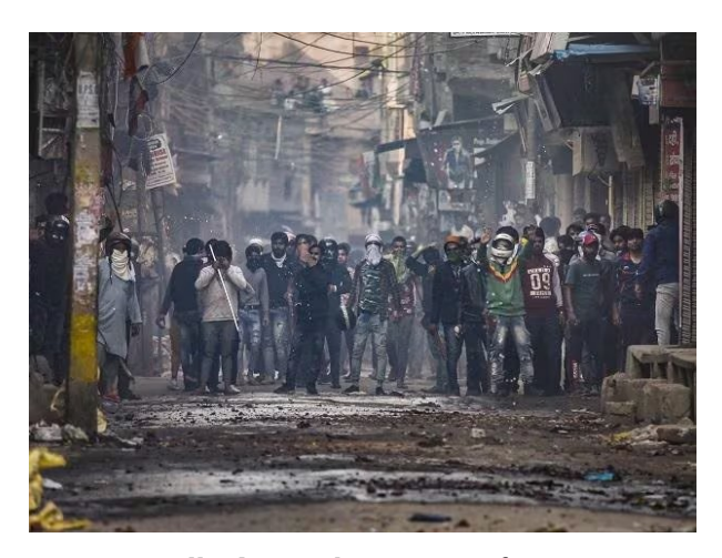
Delhi during the pogrom of 2020

For more than 70 days, the masses, especially women, have been coming out in strength to protest the new citizenship law. It was amidst such protests that the Citizenship Amendment bill was passed into law.