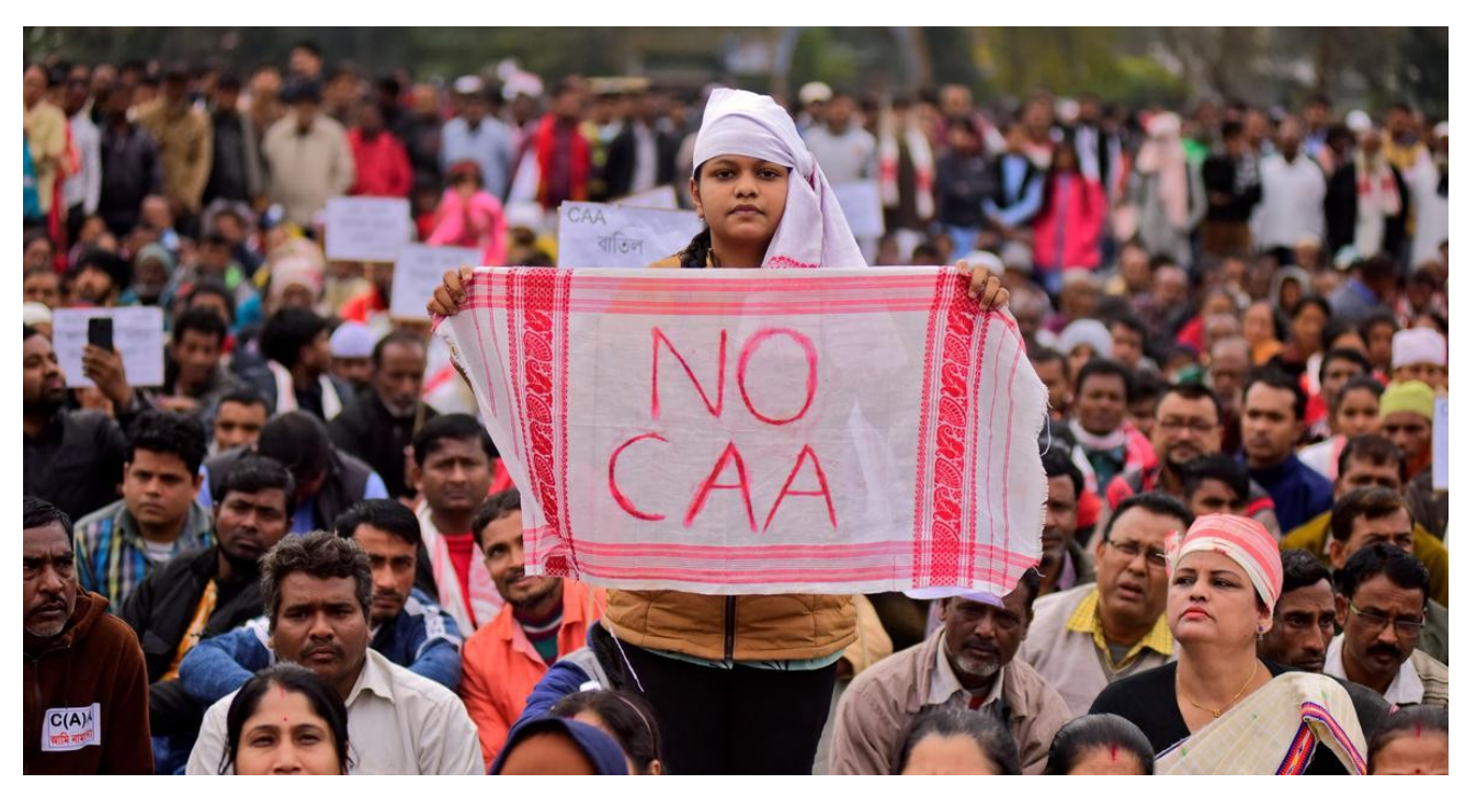
Anti CAA protests in Assam