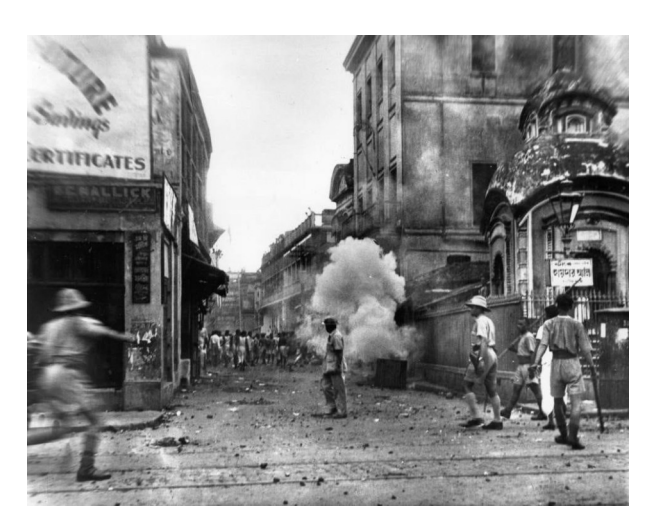
Calcutta during the riots of 1946 , the "great calcutta killings"

prospect of the reactionary BJP to take over the reins of the state, which had previously defied them over decades.