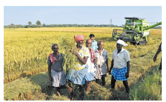
Tamil farmers boycott the elections

A dozen villages in Tamil Nadu boycotted the elections in Tamil Nadu during the first phase of the voting. These villages' lands have been earmarked for the construction of the second airport at Parandur. Villages have raised concerns over acquisition and compensation which have fallen on deaf ears on the ruling DMK government.