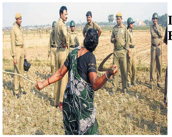
A farmer protests the police in West Bengal during last year's panchayat elections

REPEAL CAA! RESIST HINDUTVA! LONG LIVE WORKING CLASS UNITY!