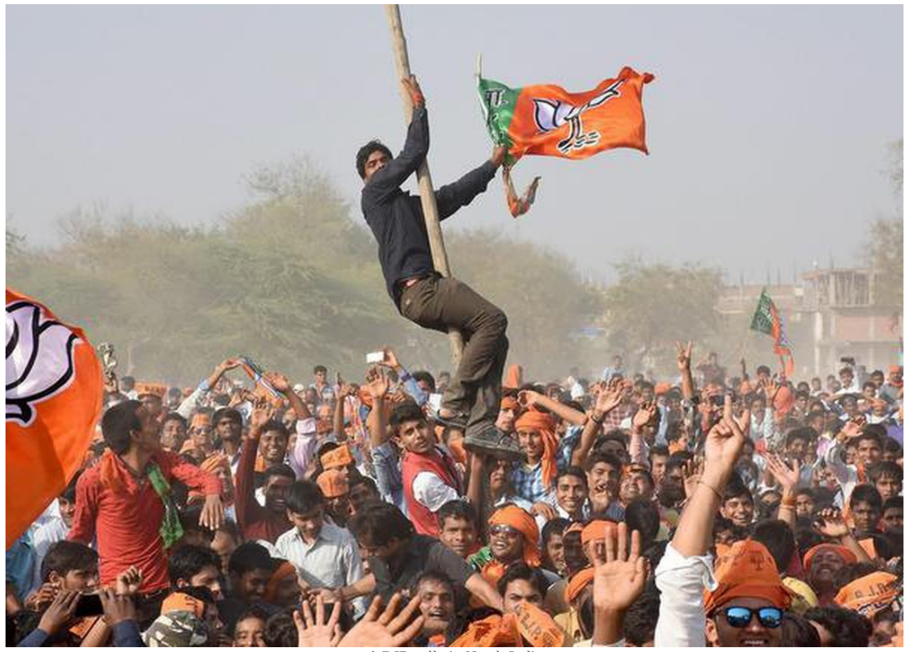
A BJP rally in North India

The New Wave is a Socialist newsletter reporting on issues of the working class, revolutionary politics, and world affairs April 2024 <a href="https://www.litci.org/en">www.litci.org/en</a>