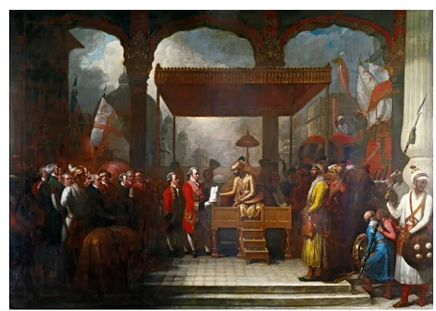
The famous painting showing the grant of diwani to the East india company

During the Mughal era, right up to the point of it's fall to the East India Company, what was then the Subah of Bengal, was the richest region of the richest Empire in the world. Bengal alone accounted for 5% of the world's GDP, this was despite the destructive Maratha invasion, and the fragmentation of the Mughal Empire in the face of the rise of the Marathas and the invasions from Afghanistan and Persia. The British East India Company was one of two trading companies backed by European powers vying for control over trade between India and Europe, the other being the French East India Company.