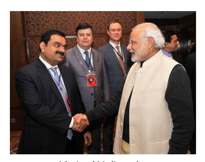
Adani and Modi together.

However, the BJP and for that matter, the Hiindutva movement, have not achieved final victory. That can only come in the form of a Hindu Rashtra, a Hindu supremacist state where Muslims can only exist as second class citizens, and Dalits would be stripped of rights and forced to accept the pitiable social position that Hindu society ascribes for them.