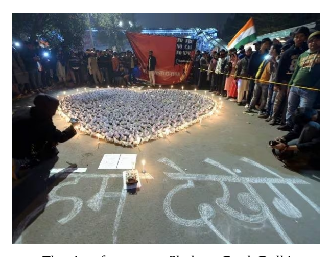
The site of protest at Shaheen Bagh Delhi

The CAA is one critical part of the Hindutva agenda to turn India into a Hindu Rashtra. It is the first time that citizenship has been made conditioned on one's religion. The frightening scenes in Assam are but a preview of what