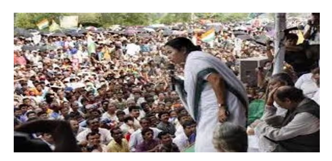
A protest led by Mamata Bannerji in solidarity with Singur farmers 2006

The CPIM whose power over the state seemed unshakeable was suddenly faced with mass protests all over the state. The main opposition party, the TMC (a breakaway faction from the Congress party), led the protests. The protests broke the power of the CPIM in the state, and plunged it to a chaotic situation, reminiscent of the last years of Congress party rule in the late 1970s. Students, and peasants joined forces to fight the CPIM.